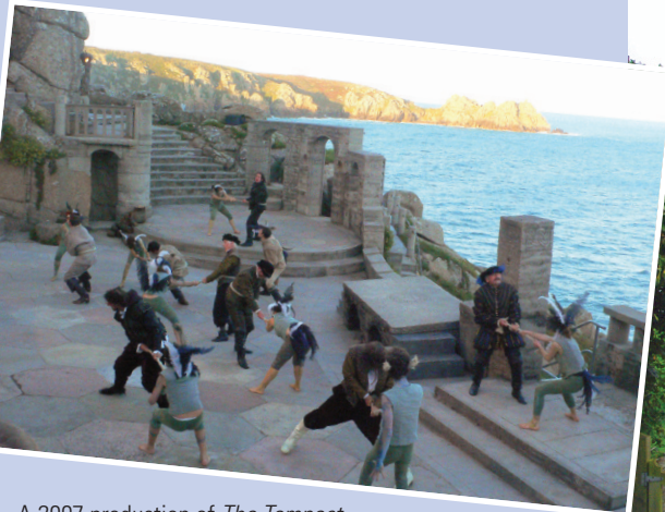
A 2007 production of The Tempest at the Minack Theatre. ROBIN JONES